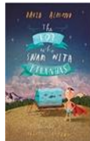
The Boy who swam with piranhas

We shall be putting all of our descriptive narrative writing skills into action to write a short narrative for our own Ifs. Children will be asked to use high quality vocabulary, correct speech punctuation and immersive descriptive language.